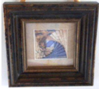
Framed iris paper folding designs created by Linda Jacobson are perfect for that wall spot where something small, but eye catching is desired. People can't help taking a second look at these works of art to see how they are constructed.