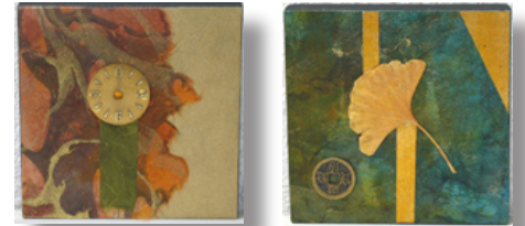
Design, texture and patterns describe the mini collages on hardwood offered by Miriam Selby. These mixed media collages sell for $15 each.