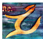
Irish-Copeland Practical Art