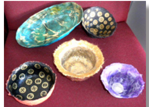
Papier Mache' Bowls by Miriam Selby are mixed media collage including hand-made papers. These colorful bowls can be used for collecting small objects or as accent pieces anywhere in your home.