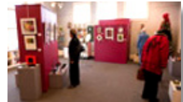
Selby Holiday Art show offered unique art

Membership reminders have gone out in the mail. So, for those of you who are due to renew, please do so promptly. Also encourage your friends to join us in presenting art to our Keizer community.