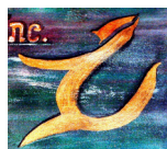
Irish-Copeland Practical Art