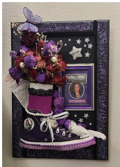
First Place – “We Did It, Joe!” , mixed media, Jo Ann Leadingham

Excellent use of limited palette and tight composition. The color unifies what would otherwise be scattered eclectic elements. This makes the variety of pieces used in this assemblage work.