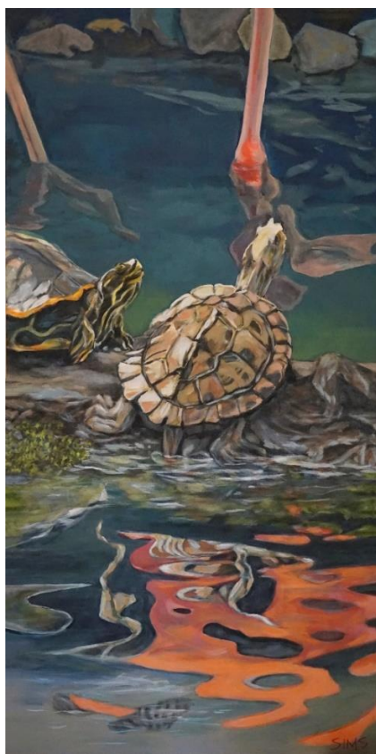
“Don't Mess with Me” , acrylic, Carol Sims

Not only does this painting tell a story, but the variety of shapes is also pleasing, especially in the reflection. Masterful use of the medium.