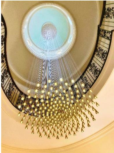
First place: "Celestial Lights", by Janice Christman.

An interesting study of repeated curved lines & surfaces juxtaposed by the veil of straight lines holding the chandelier. It almost brings on a sense of dizziness just by looking up into that ceiling.