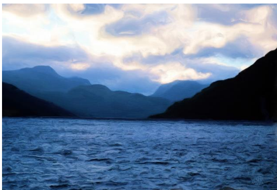
Second place: "By the Bonny Stormy Banks of Loch Lomond", by Gary Olsen-Hasek.

An interesting study of repeated curved lines & surfaces juxtaposed by the veil of straight lines holding the chandelier. It almost brings on a sense of dizziness just by looking up into that ceiling.