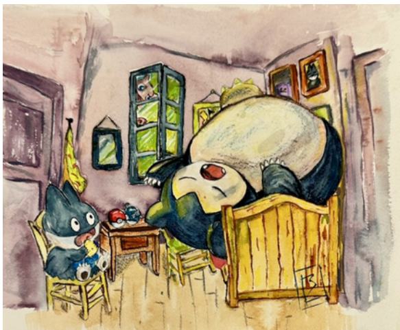
“Bedroom in Kanto: The Dream of the Snorlax” by Rebecca Lockwood