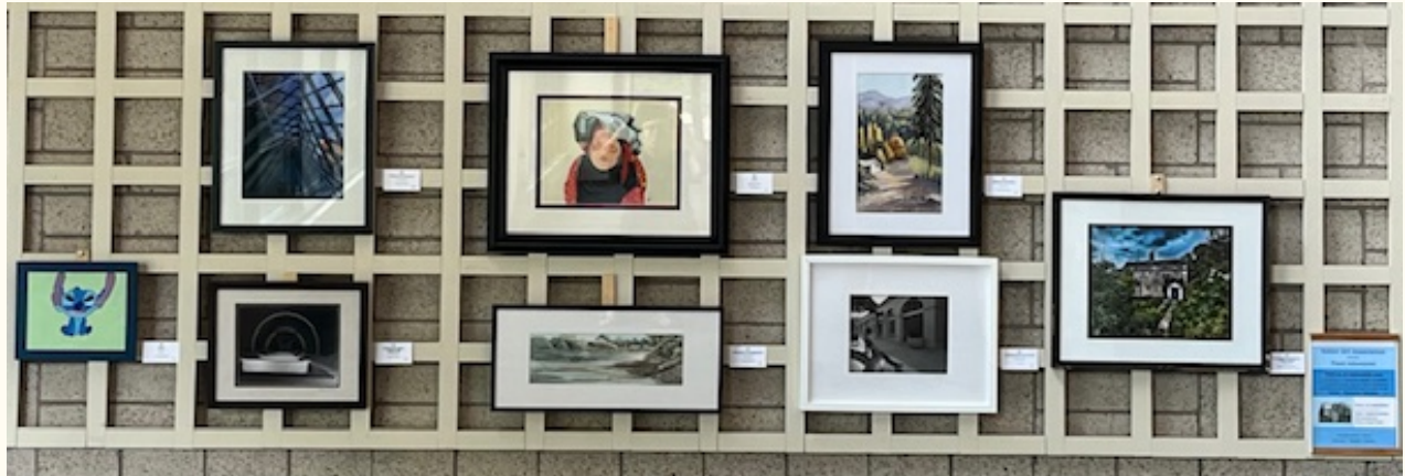
Award winners from the JULY 2025 Travel Adventures Show