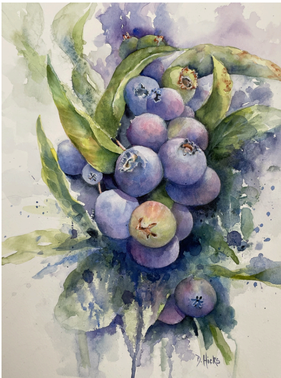
“Nodaway Blue” by Dianne Hicks