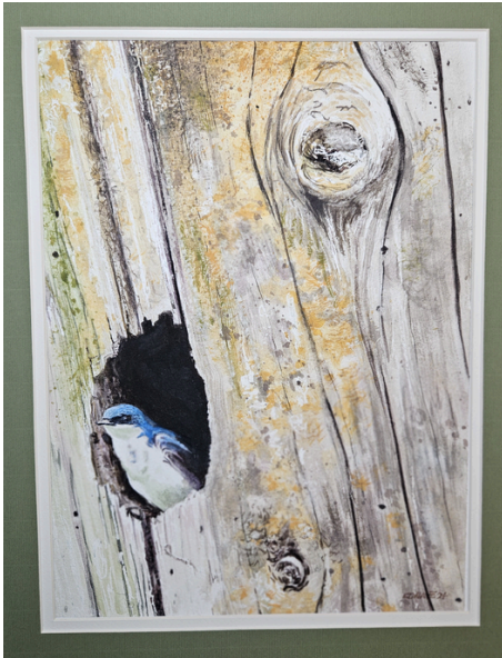
“Wetlands Tree Swallow #2” by Diane Nave