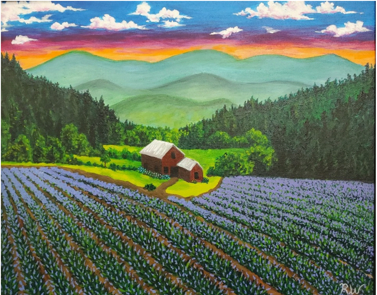
“Lavender Dreams” by Rachel Wood